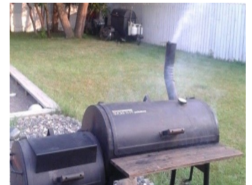
“Where There's Smoke There's Fire”