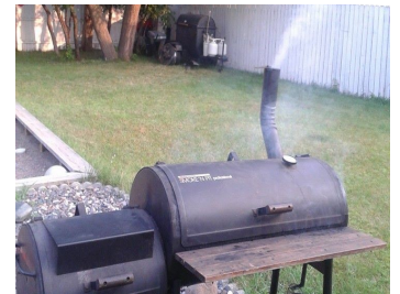
“Where There’s Smoke There’s Fire”