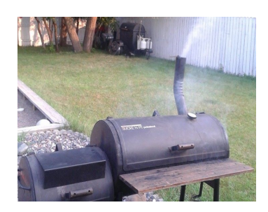
"Where There's Smoke There's Fire"