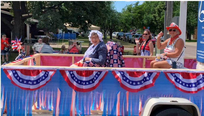
Monticello Riverfest Parade 2022 "Red, White & Blue"

Why would you recommend Women of Today to someone who is not a member? The friendships developed with others who have the same interest in volunteering is invaluable. This diverse group of women comes together, who may not have met without the Women of Today organization. It is a wonderful network and a place to gain lifelong friendships.