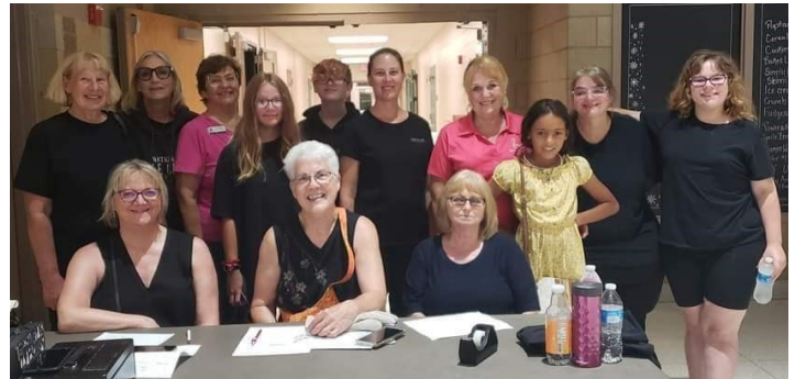
Riverfest 2022 Talent Show