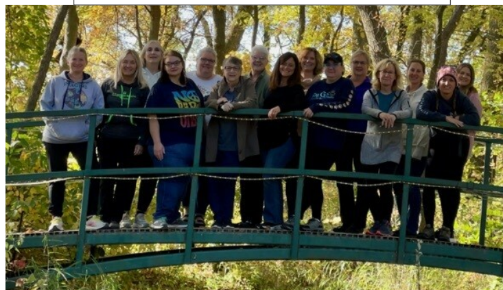
Girls Getaway Weekend—October 2022

PVP Kolann: What does she like about our Women of Today chapter meetings?